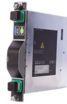
This picture is shown as a guideline only. Actual module may differ depending on the configuration selected.